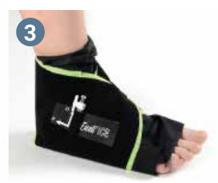
Fold down the right part of Turn the tap to 0 the cold pack on the left and screw the pump. side and fix the velcro.