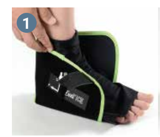
Place the foot in the cold pack. The heel must be in the hole.

Introducing the Ankle Cryo Kit, an ankle cooling solution that is incredibly easy to apply. With its universal onesize-fits-all design, it will fit any ankle. This kit includes one single cold pack surrounding the ankle and an easy Velcro, providing comprehensive coverage for your ankle. The innovative design combines cold therapy with compression in a single, convenient piece. Achieve optimal compression using the included manual pump.