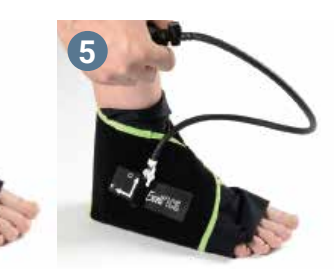
Inflate (do not exceed 10 pressures). Turn the tap to F and unscrew the pump.